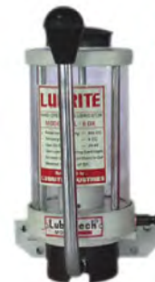
Manual Lubrication Pump