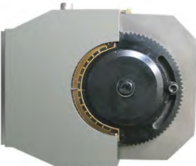
Impression Adjustment by Worm Gear & Eccentric Bushes