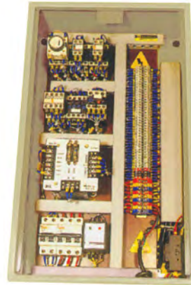
Control Panel (Detachable Socket System)