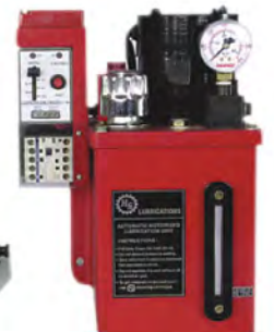
Auto Lubrication Pump