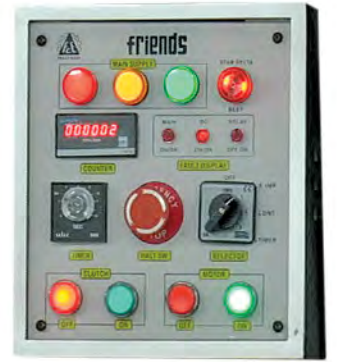
Operational Panel Side Mounted (Detachable Socket System)