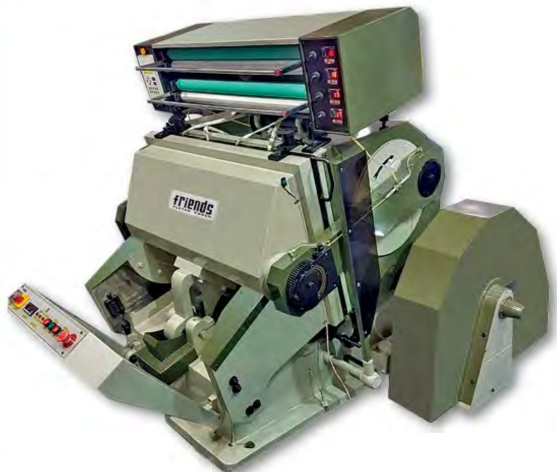
Sizes of Hot Foil Stamping Attachment