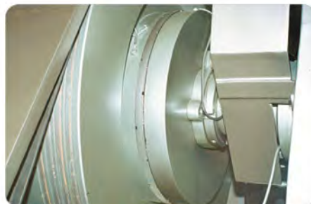
Electromagnetic Clutch & Brake System for Microns Adjustment